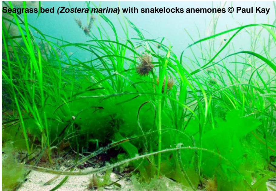
Seagrass bed ( Zostera marina ) with snakelocks anemones