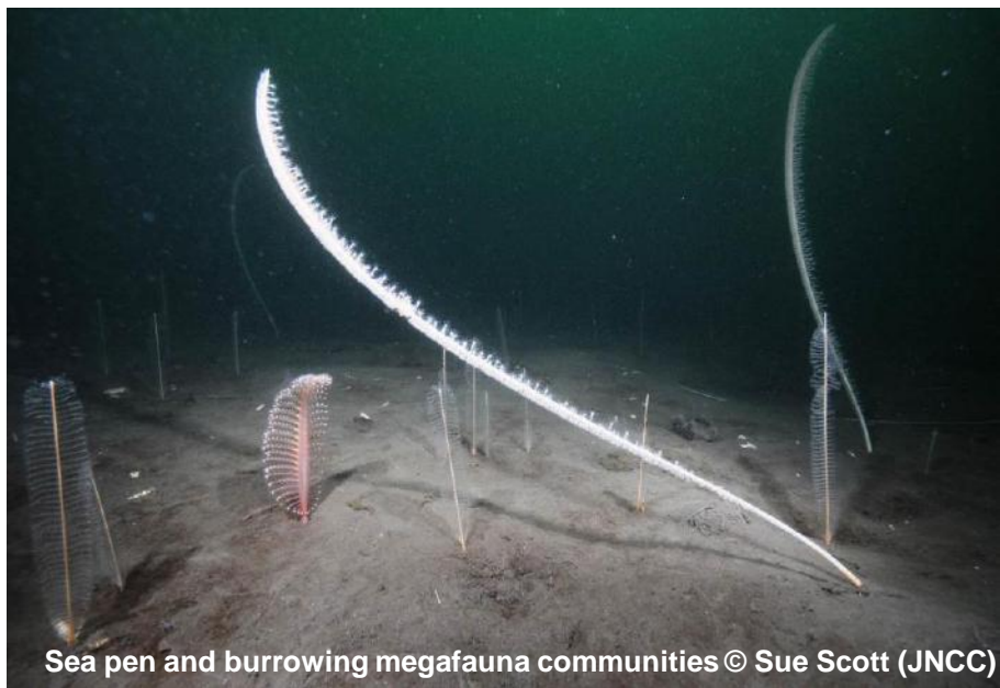
Sea pen and burrowing megafauna communities