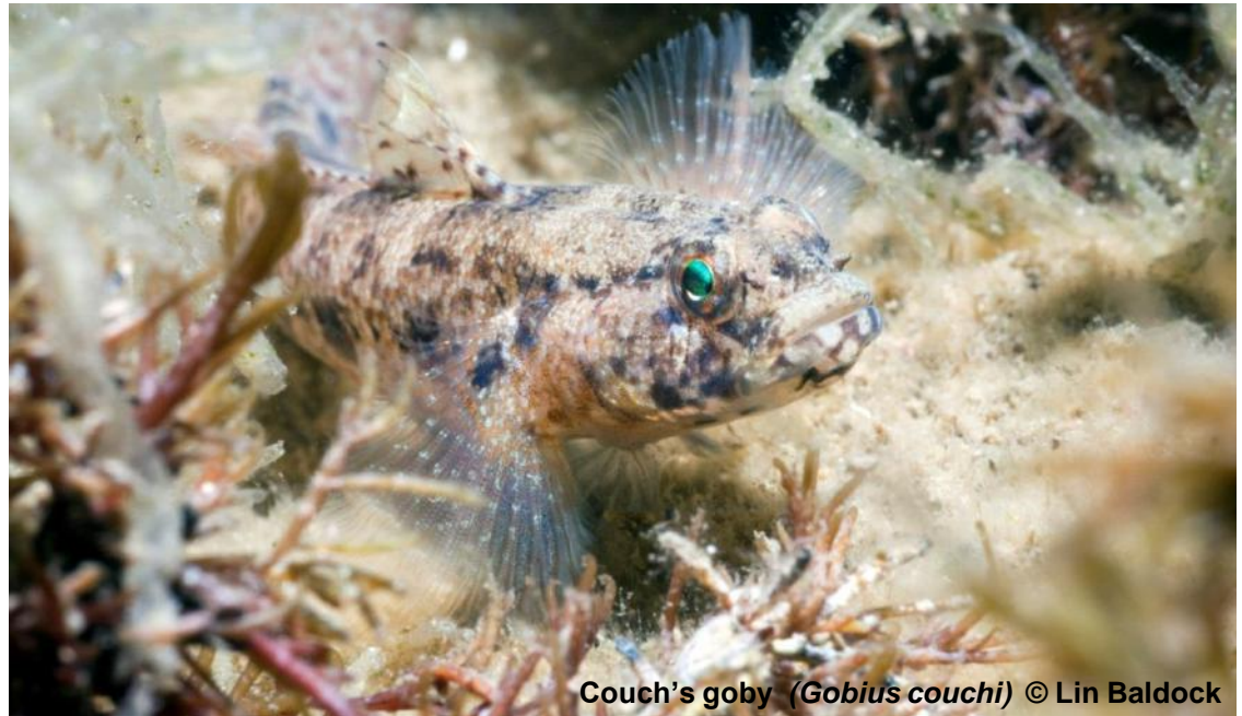
Couch's goby ( Gobius couchi )