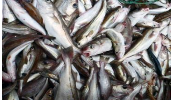
Fish & Shellfish