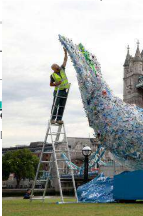
PLASTIC WHALE (MATT AL)